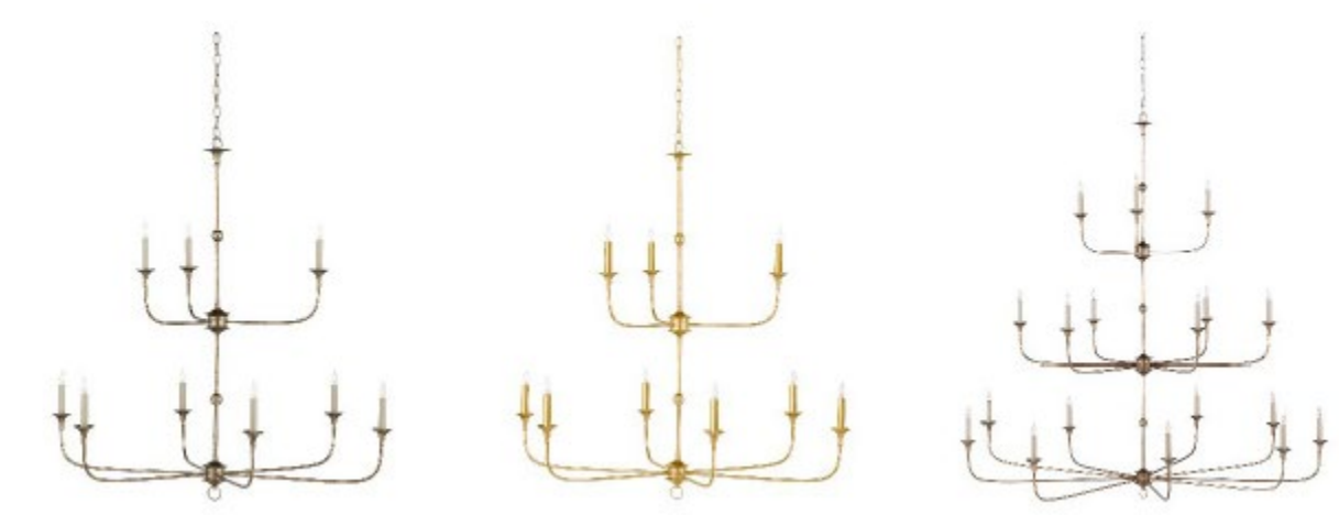
Recalled chandeliers, two tier bronze, two tier gold, three tier bronze